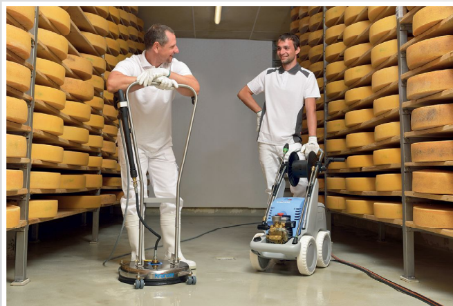
Fig. Non-marking version (NoM). Info on page 58