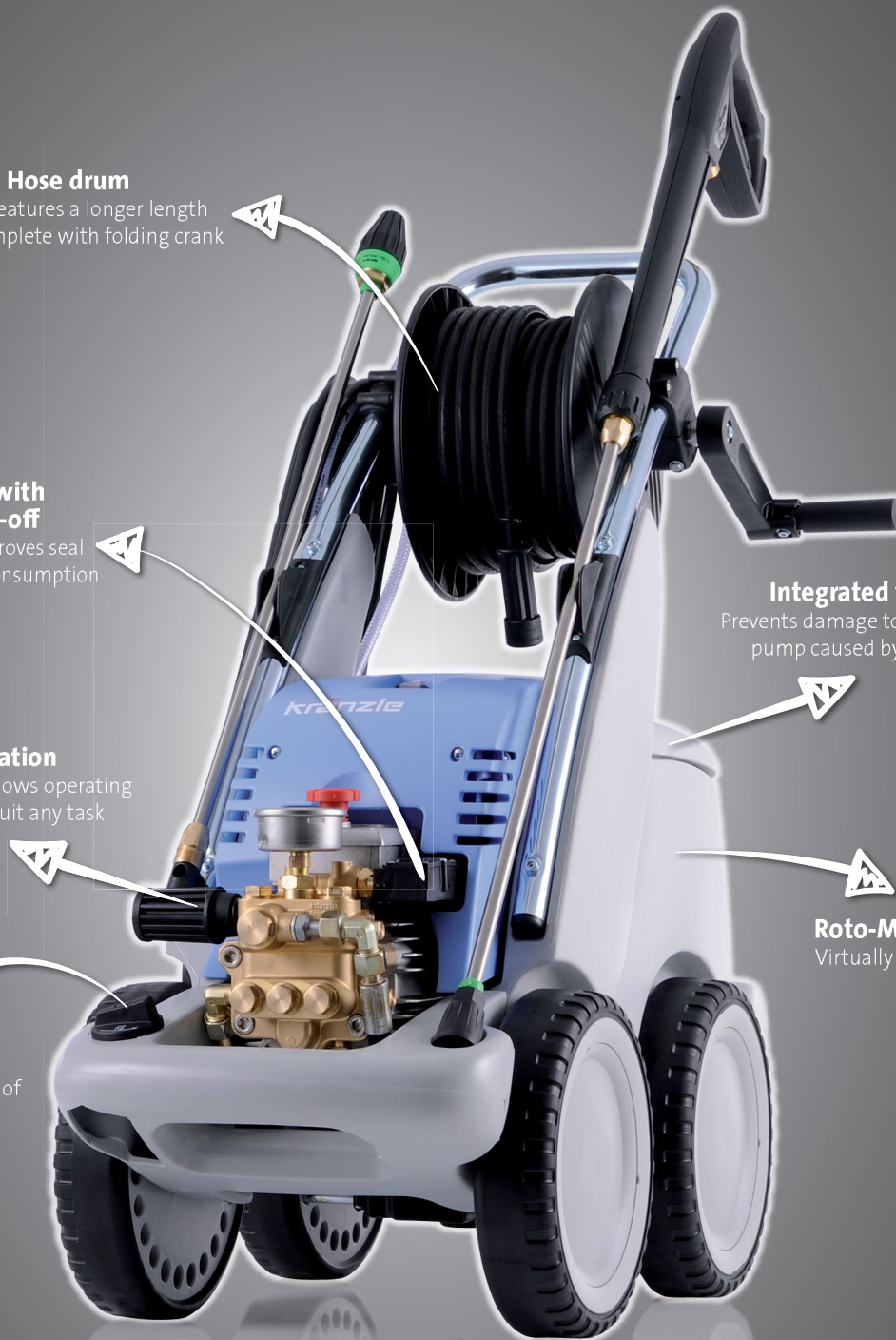
Figures: quadro 799 TST

Injector system for dispensing of cleaning agents